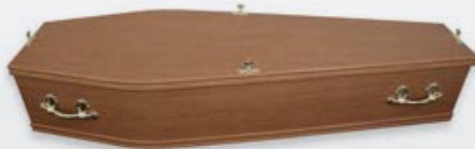
Wood effect coffin featuring flat lid and sides

We are here for you 24 hours a day 365 days a year